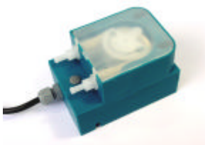
III: KONSTA®PLUS, REGO®